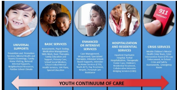
A Responsive Children's Mental Health Delivery System

OUR VISION: Ramsey County youth will have the strengths, skills, relationships, supports, and opportunities that they need to experience mental health and wellbeing.